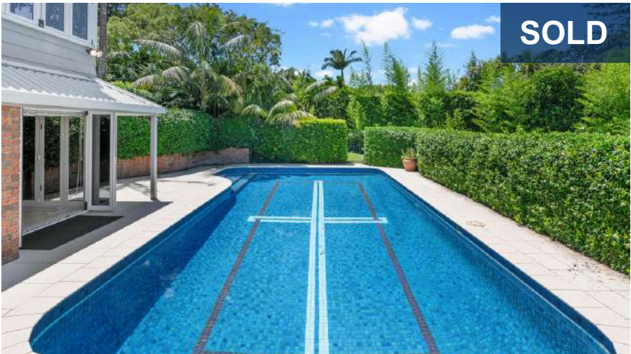
107 Deep Creek Road, Torbay