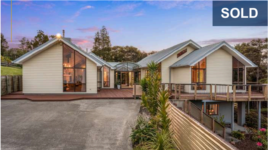
68 Tender Road, Dairy Flat